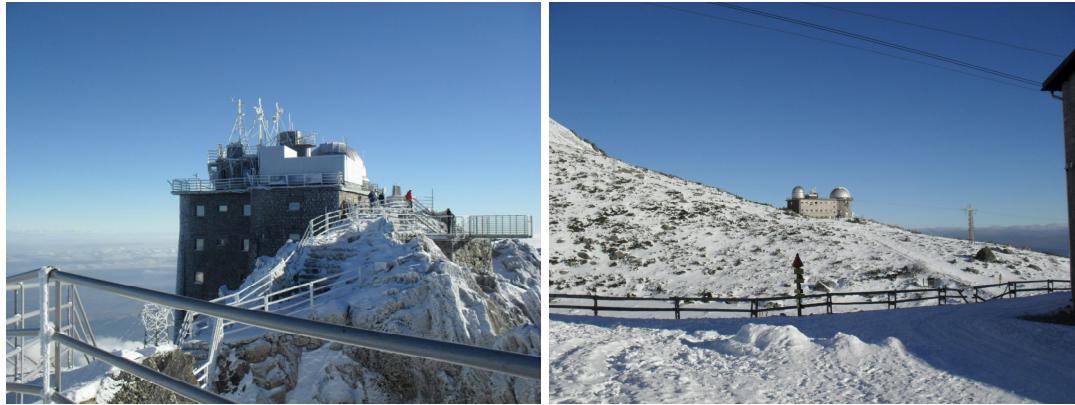
Figure 2. Stations Lomnicki Shtit (left) and Skalneto pleso (right)